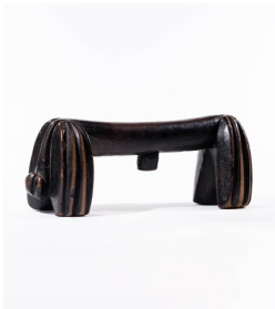
THE BULL HEADREST ANONYMOUS NGUNI ARTIST SOUTH AFRICA