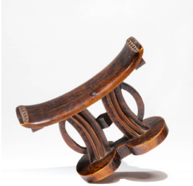
SWEET DREAMS HEADREST ANONYMOUS TSONGA ARTIST SOUTH AFRICA

https://www.dropbox.com/sh/faa5cb1yhkm13b9/AABCMUSBHgYMRn4x3u1ku1pXa?dl=0