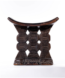
SIX CIRCLES HEADREST ANONYMOUS SHONA ARTIST ZIMBABWE