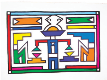
FRANZINA NDI MANDE "UNTITLED" (1993) MABHOKO, SOUTH AFRICA

Acrylic paint on paper 56 x 76 cm 22 x 29 7/8 in